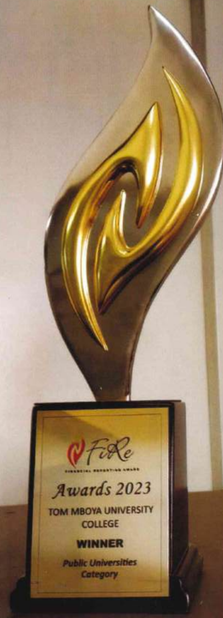
Tom Mboya University awarded a trophy in the FiRe Award 2023 in East Africa for emerging the winner in Financial Reporting under Public Universities category.